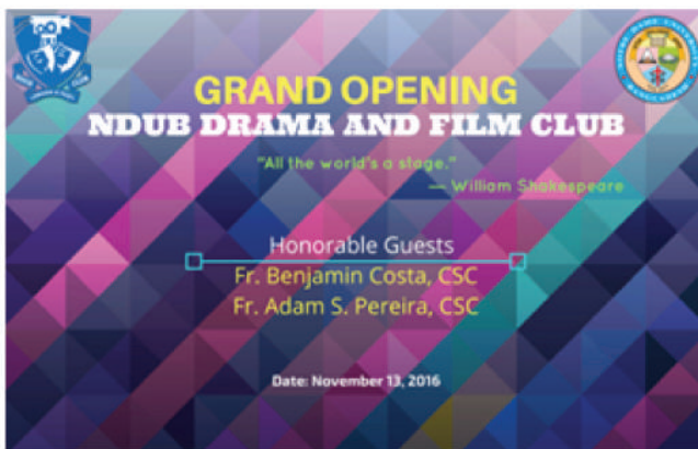
Banner of the Orientation Program

The necessity of opening some clubs at NDUB was first discussed in a teachers