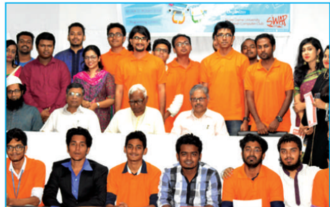
SWAP trainers along with guests, NDUBCC moderators and students after Competition of SWAP Competitive Programming Workshop at NDUB

SWAP (Student Welfare Association and Platform) on competitive programming was organized by NDUBCC. There were 4 classes and contests in 4 days and one