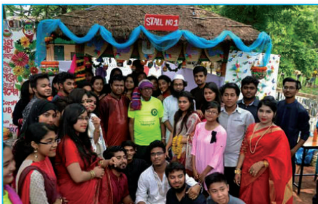
NDUBCC stall on Club Day with colorful hand-made decorations

On 20 May 2017 Club Day of NDUB was held at the campus. It was an event intended to promote the club activities of NDUB and at the same time to encourage the students to engage themselves in economic and cultural activities that would benefit them and their respective clubs. It