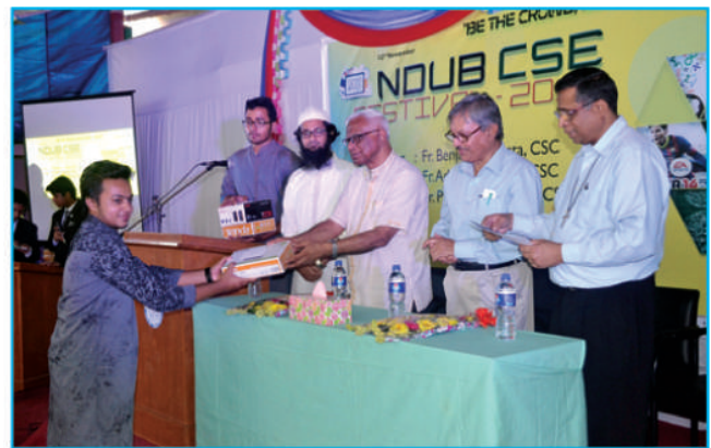
NDUBCC encourages the bright students with prizes and certificates to develop their competence and skills