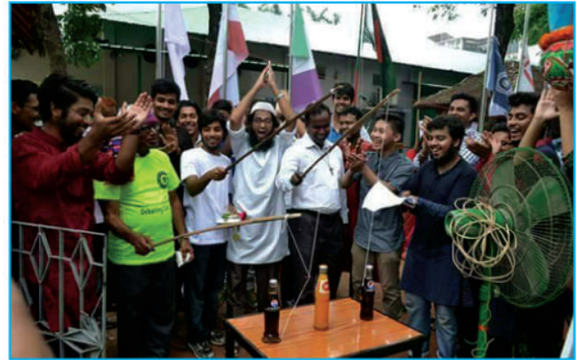
VC-in-charge shares some moments with NDUBCC members at the exciting gaming zone.

was also an occasion for celebrating the Bengali New Year, 1424. The event started at 9.00 a.m. with the arrangement of a fair.