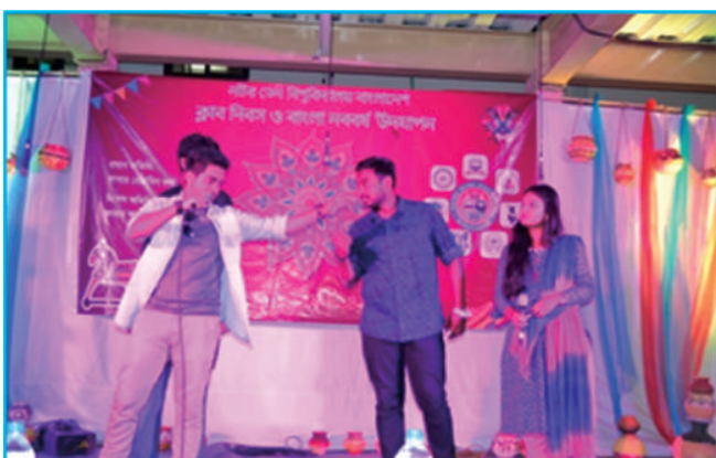
Members perform on Club Day