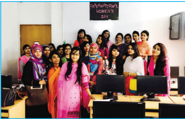
NDUBCC celebrates International Women's Day at the campus on 8 March 2017

10 November 2016 was a glorious day for the CSE Department. On this day, the first CSE festival of NDUB was held with the