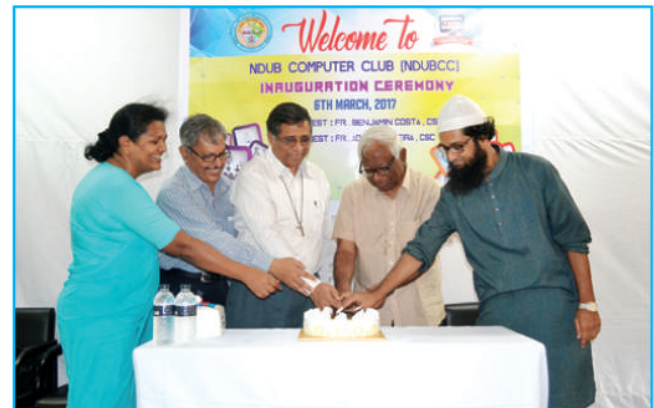
Happy moment of inauguration of NDUBCC on 6 March 2017

different sectors of computer science outside the classroom. It also intends to hold workshops on topics such as