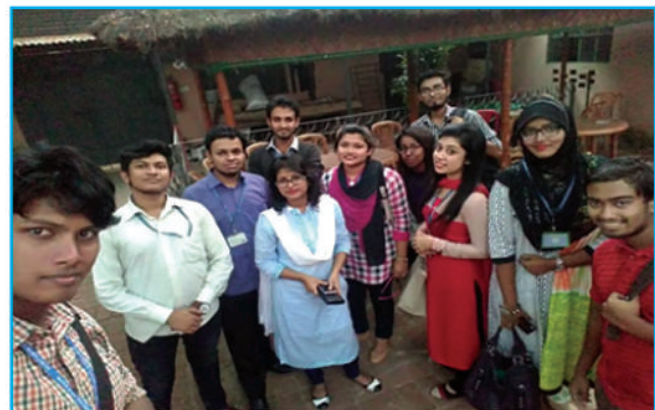
Members and Moderator at one of the Café Adda sessions

With a view to improving the communicative skills of the members, the think tanks