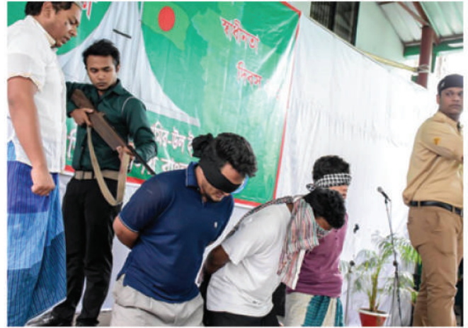
Scene From the Drama 'Mukti Gatha'