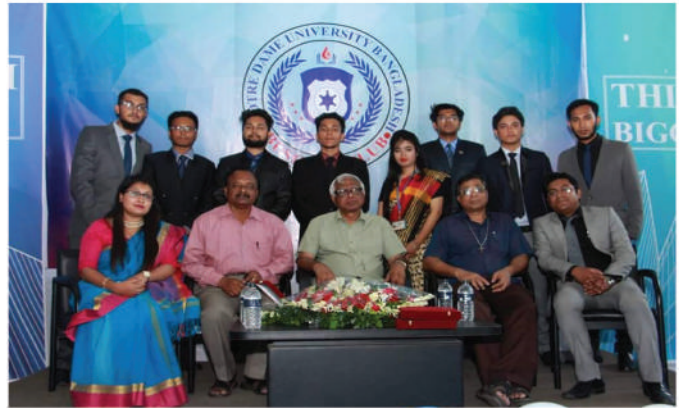
Executive Committee Members along with Chief Guest, Special Guest, Chairperson & Coordinator, BBA & MBA Program Moderator and Co-moderator, NDUBBC