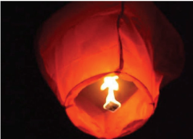
Fanush on Club Orientation