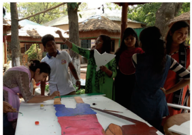
Preparation for Club Day