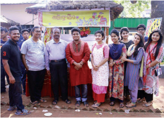
Club Members with the Chairman of BBA Program