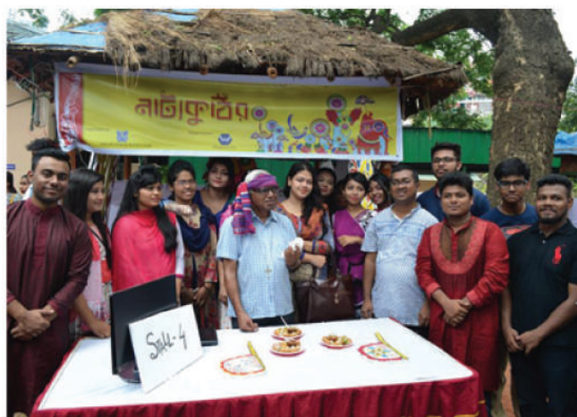
VC-in-charge with the club members on Club Day

The Orientation Program of Drama Club was arranged on November 13, 2016 with a