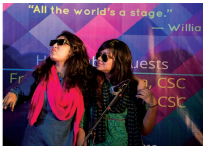
Scene from the 'Drama Adam Teasing'

students who kept the club alive. The NDUB Drama and Film club was inaugurated along with 5 other clubs on February 6, 2016. The Drama Club took active part in different programs such as Orientation for students, Independence Day, International Mother Language Day, etc. organized by the university. As a club we staged 2 dramas in 2015, and 8 dramas and 1 one-act play in 2016. All the performances were highly appreciated by the audiences.