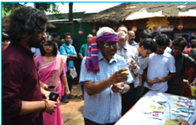
Vice Chancellor (In Charge) at NDUBEC's Stall on Club Day

bers who will be mentoring general students regarding various academic issues. Not only the members of the club can