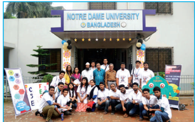
NDUB CSE Fest brings a festive mood among the students and teachers wearing festival T-shirts with the mascot "Turing"

from 4 p.m. Students from all departments cheered up their home team and expressed their love for Bangladesh and NDUBCC.