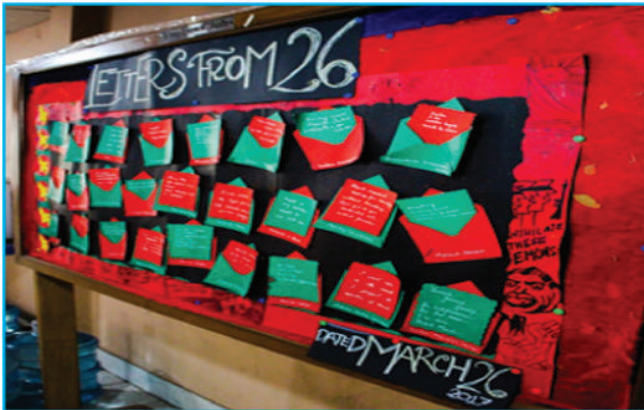
NDUBEC's first wall magazine

NDUB English Club is trying to get THE DAILY OBSERVER as Print Media Partner, Bangla Vision as television media partner, Roarbanglaas online media partner, Young Observer as tabloid media partner, Avant-garde Productions as virtual media partner and Dhaka FM 90.4 as radio partner.